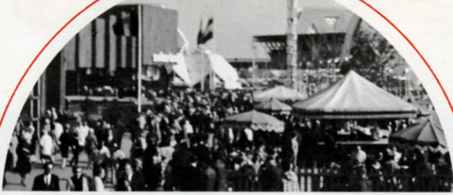
Almost a complete new show in the magic setting of Expo 67.