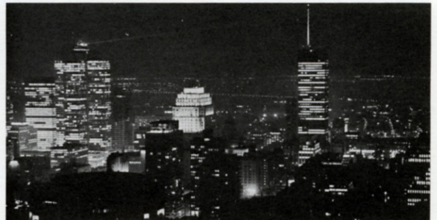
Montreal by night

Montreal is the perfect starting place for unforgettable trips and jaunts throughout picturesque Quebec. Excellent highways speed you to the world-renowned Laurentian playground or the Old World charm of Quebec City and its fortress-like Citadelle . . . the magnificent Saint-Maurice Valley or the vast hunting and fishing paradise known as Abitibi-Temiscamingue. Opportunities for travel are almost unlimited.