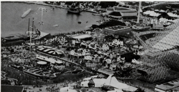
So much to look at, so much to do.

Over 135 acres of pure entertainment, spectacular rides and thrills, worldwide adventures in eating and shopping. Enjoy Fort Edmonton-pioneerland . . . the Montreal Aquarium and Marine Circus . . . Le Village . . . the Garden of Stars . . . the Gyrotron . . . enough attractions — and more — to keep you 'funning' till the wee hours of the morning. Every morning.