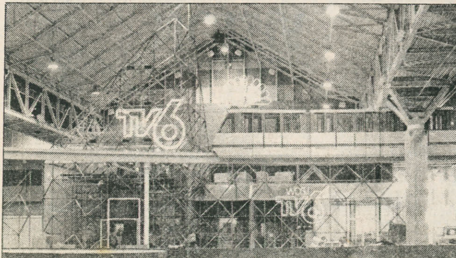
The TV6 Telecommunications Center at the fair

Starting Saturday, Ch. 6 will try to answer that question.