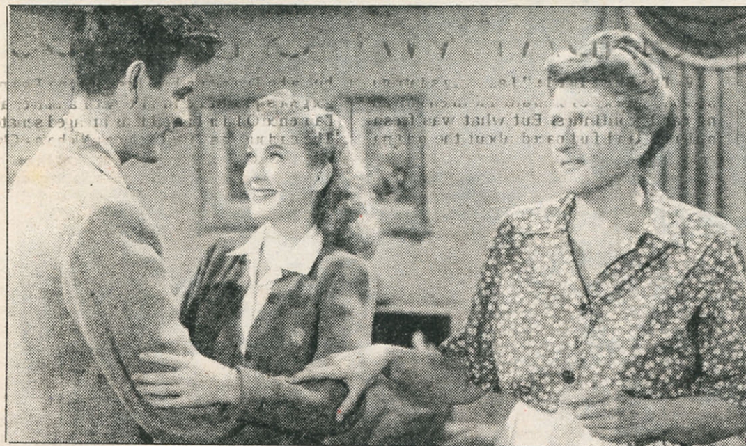
Before he came to Hazzard County, James Best courted Ma and Pa Kettle's daughter Rosie (Lori Nelson) in 'Ma and Pa Kettle at the Fair' Saturday, 9 a.m., Ch. 38. That's Marjorie Main as Ma.