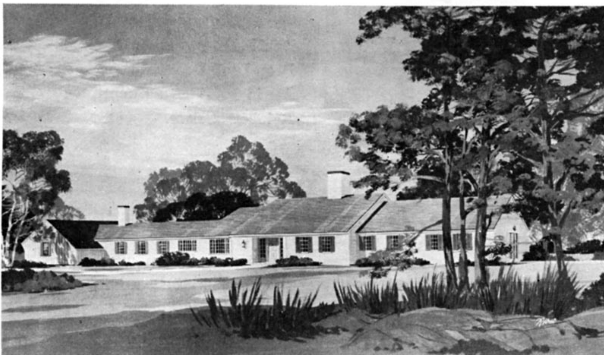
TRADITIONAL HOME will also be seen at the New York World's Fair when housing is on parade beginning in April. It will be fully constructed and completely furnished.