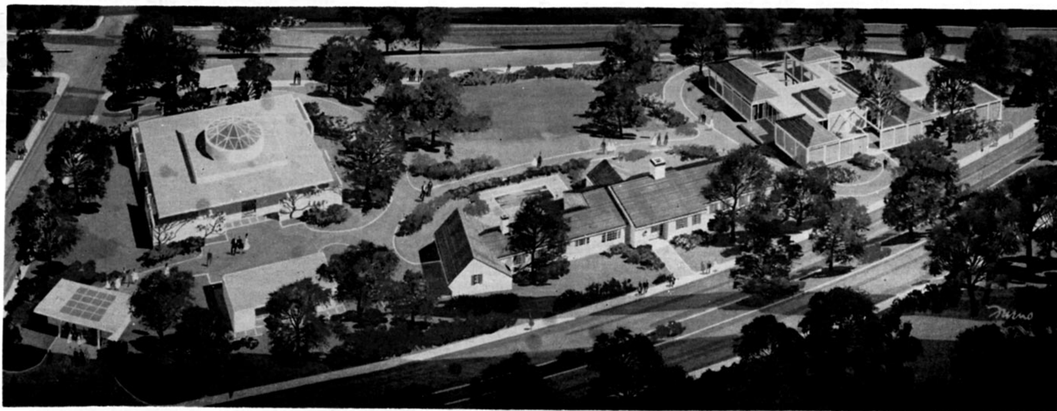
HOUSE OF GOOD TASTE site is located on nearly two acres of ground just inside the main entrance of the 1964-65 New York World's Fair. Modern House is at left, traditional house is in center foreground and the contemporary house is view at the right in the model above.

The total effect is one of informal variety.