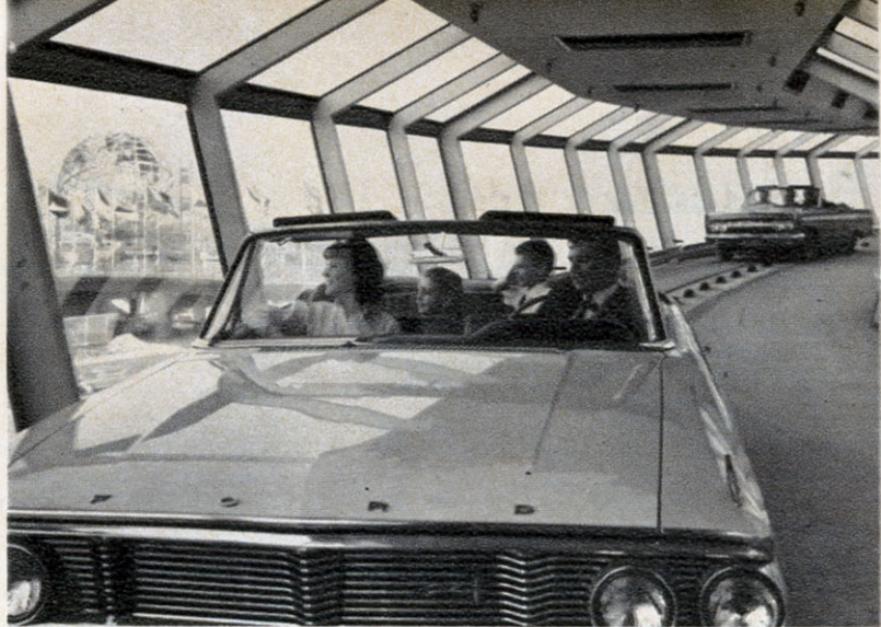
Family group enjoys panoramic view from the Magic Skyway