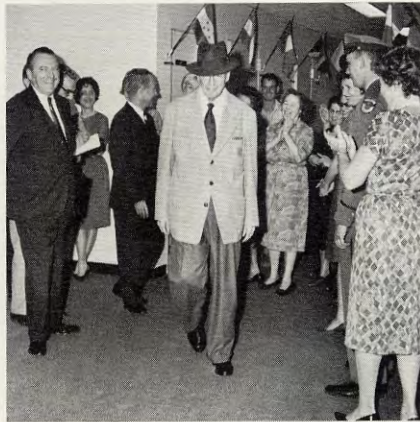
Warmly applauded by Fair personnel General MacArthur proceeds to ...