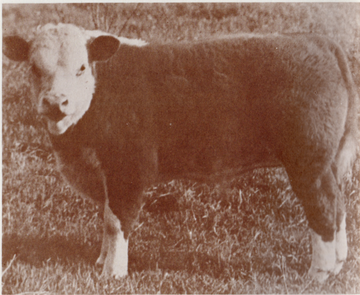
Good calf. Good photography. Good pose