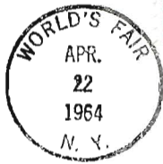
New York World's Fair Stamped Envelope Issued at New York World's Fair Post Office April 22, 1964