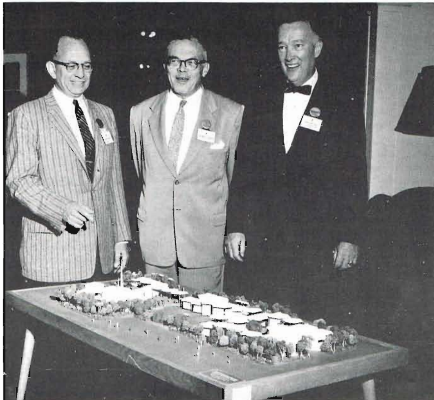
Three New England Council World's Fair Corporation officers examine a miniature of the New England States World's Fair Exhibition to be erected next to the Unisphere at the New York World's Fair.

The entire Exhibition has been planned to present New England, its charm, its history, its advantages and its opportunities to the World.