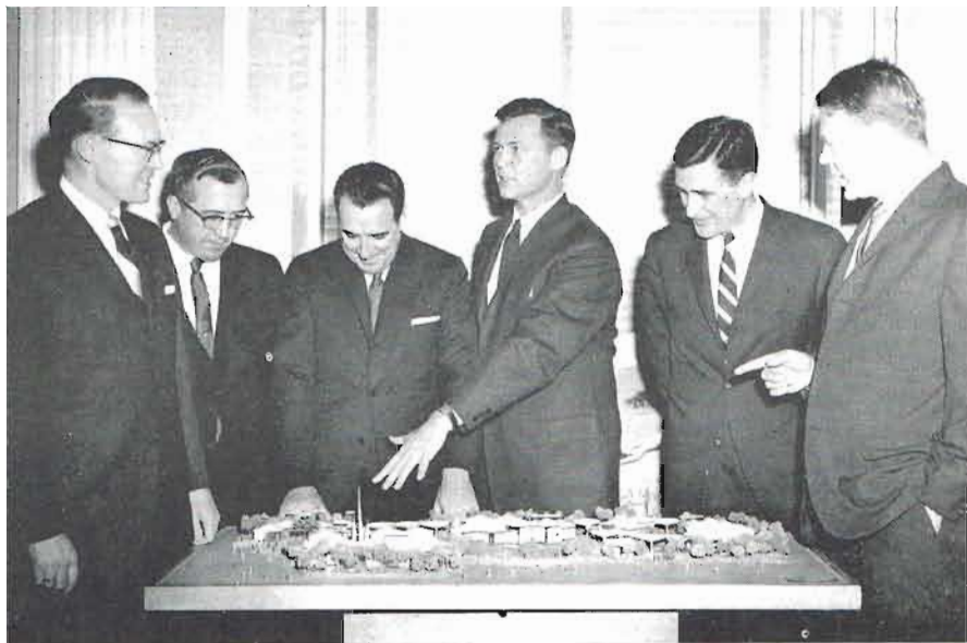
New England's six governors check over model of the region's pavilion for the New York Fair . . .

The road to the World's Fair has not been an easy one for the New England states. Delays and frustrations have been frequent. Changes in the composition of successive Governors' Conferences and legislative inertia have eaten up valuable time. While a few more de-