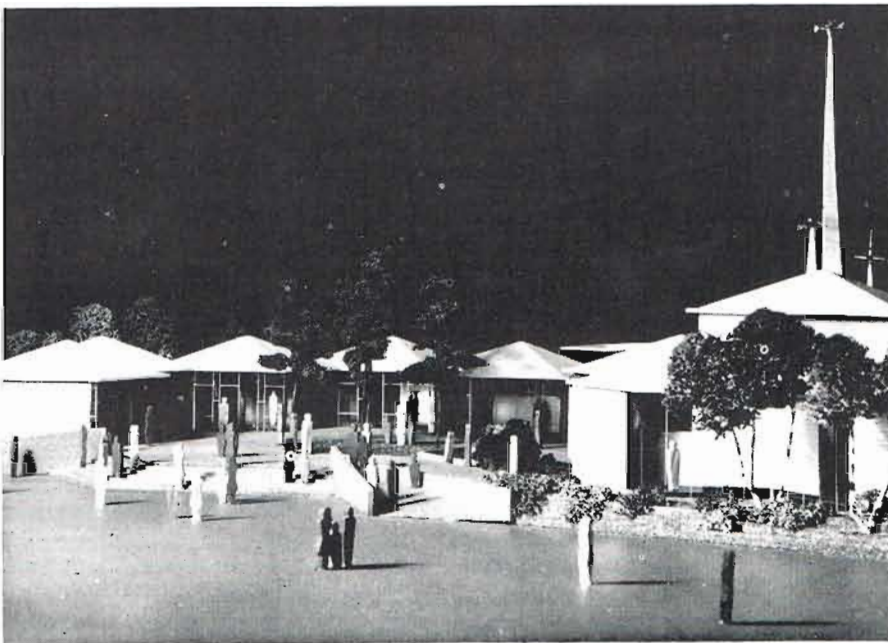
. . . which will attract some 70,000,000 visitors in two years—right at our front door

tails are still to be cleared, it is expected that the project will be moving into high gear early this month.