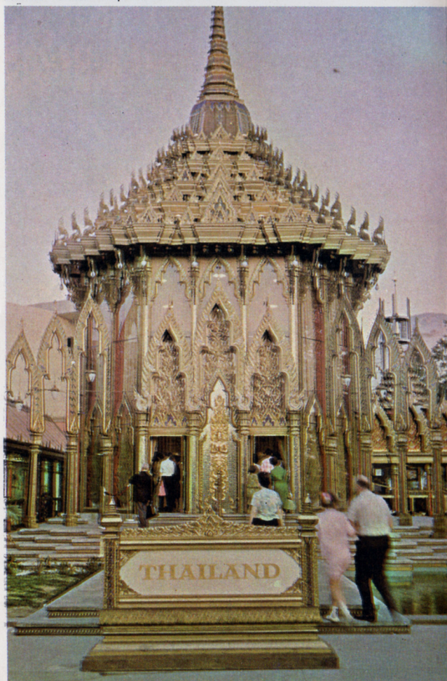
Thailand's exotic "Temple of Dawn"