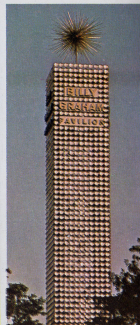
Billy Graham pavilion