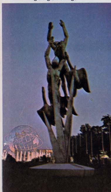
A sculpture garden