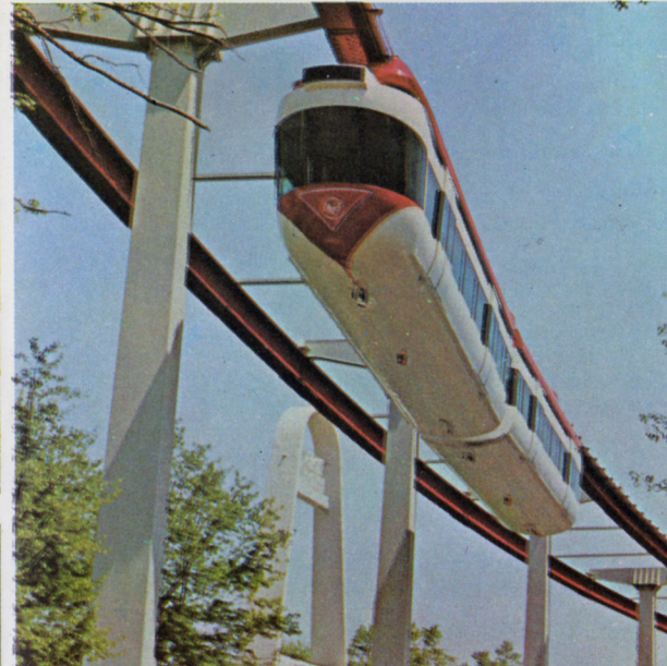
AMF's Monorail circles over the Fair