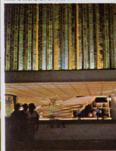
The United States pavilion