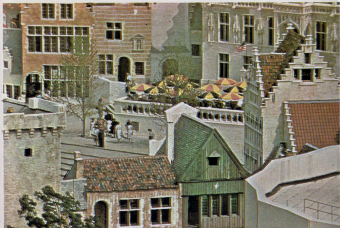
The charming Belgian Village