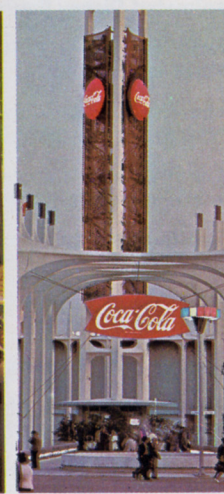
The Coca-Cola Carillon