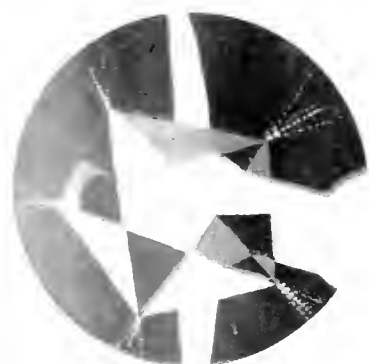
Below: one of cel sketches made for Abbott Labs' "Chemical Man" exhibit.