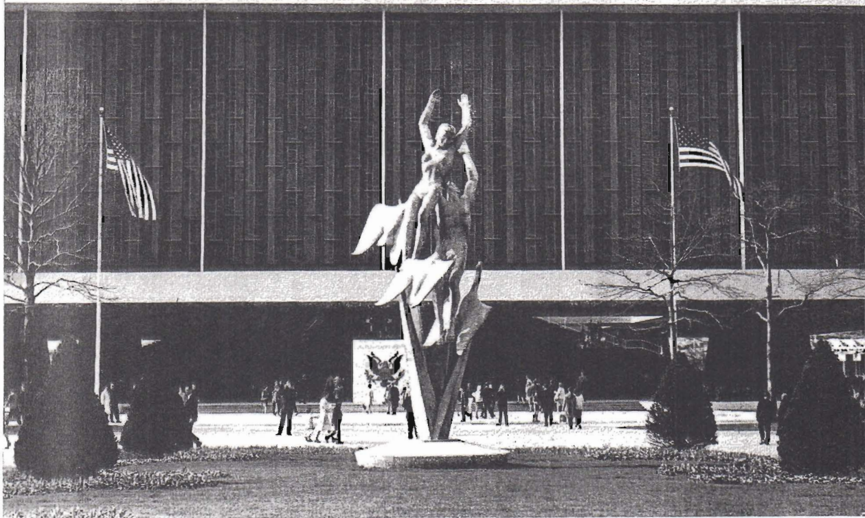
A 330-foot facade of multi-colored glass draws the visitor's eye to the beauty of the United States Pavilion.