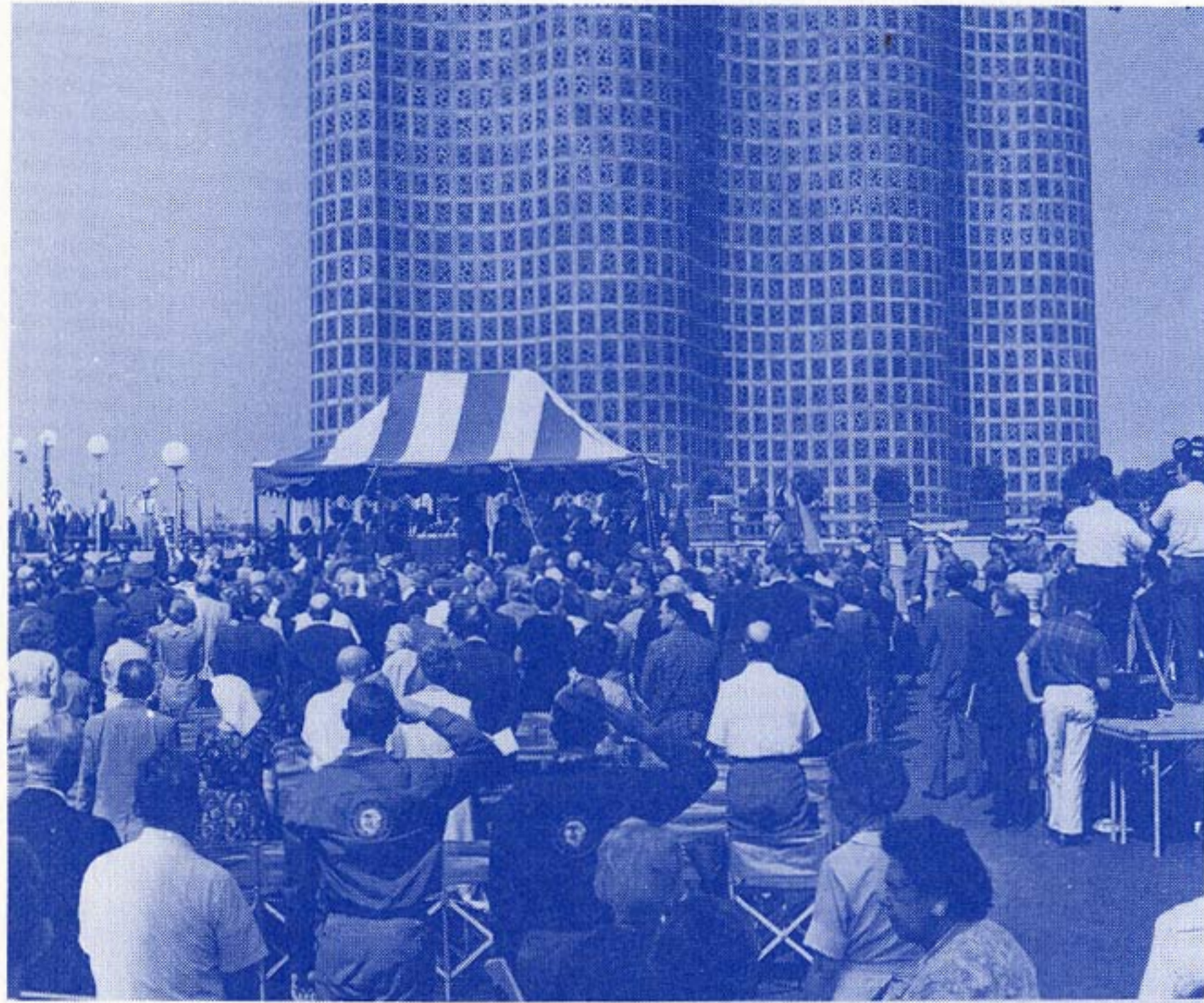
Opening of ceremonies at the dedication of the permanent Hall of Science on September 9, 1964, at the New York World's Fair.

has grown to new dimensions and new importance in our day.