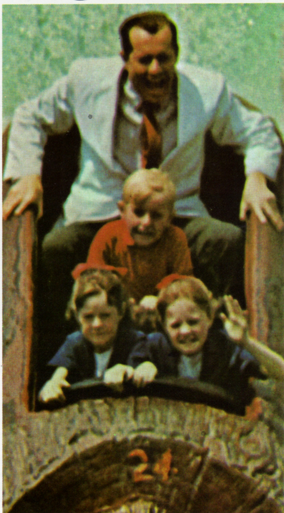
The thrilling Log Flume ride