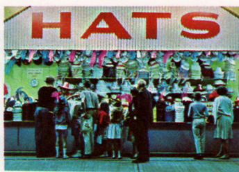
Buying souvenir Fair hats