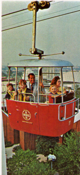
On the Swiss Skyride