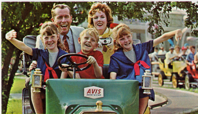
Children love the Avis Antique auto ride