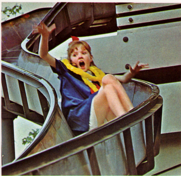
The Danish playground offers baby-sitting attendants