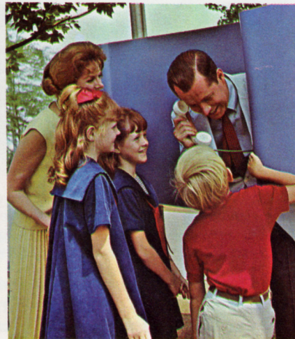
Trying Bell's new push-button telephone