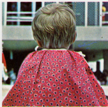
Getting a better view