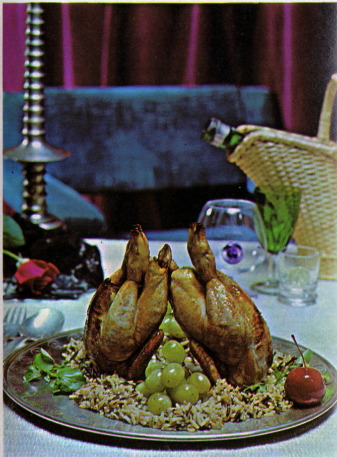
Roast partridge with wild rice and grapes, at the Spanish Toledo restaurant

Spend as much, or as little as you like. A truly magnificent meal at the Toledo in the Spanish pavilion will cost a minimum of $7.00, while a