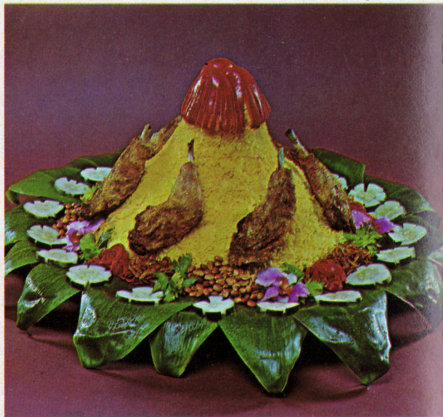
Traditional Nasig Kuning at the Indonesian pavilion

Exotic dishes or familiar favorites... there is a world of wonderful food to enjoy at the New York World's Fair