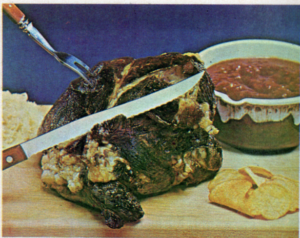
Barbecued beef served at the Missouri Snack Patio

Enjoy Hawaiian-American food at the Restaurant of the 5 Volcanos in the Hawaii pavilion for $2.95 up or Mexican-American specialties at New Mexico's Hitching Post for $2.49.