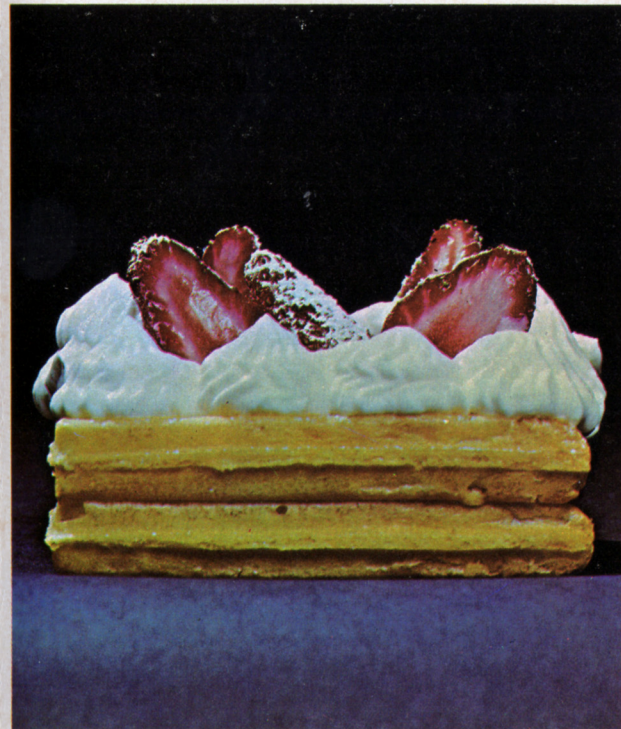
Strawberries and whipped cream on a Belgian waffle

For those who prefer more familiar food, there are over fifty delightful restaurants to choose from, at every price range. Here are a few: