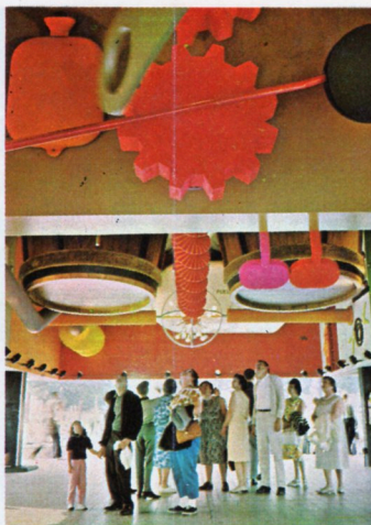
Inside the Chrysler "engine"