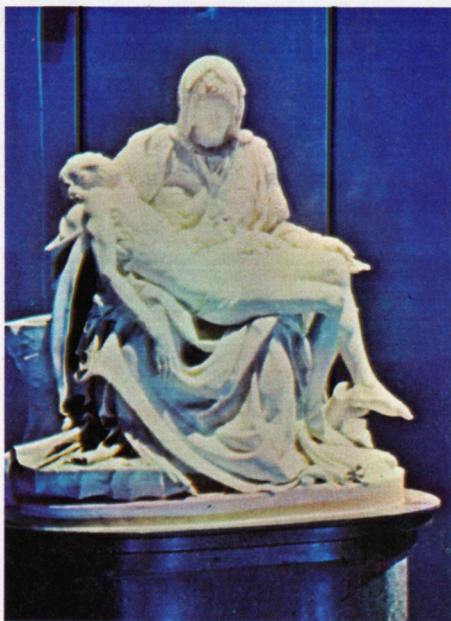
The "Pieta" at the Vatican pavilion