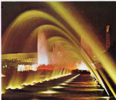
The Promenade fountains