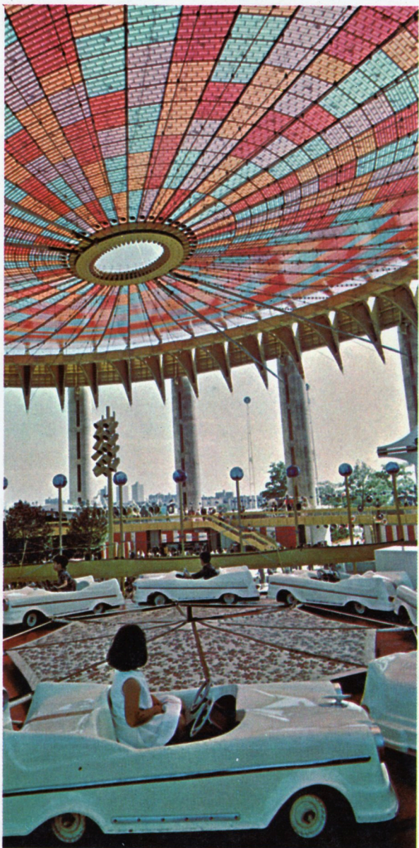
Fun at the New York State Pavilion