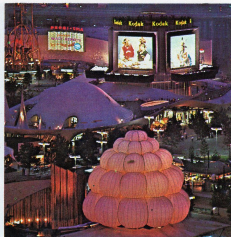
The Kodak pavilion at night